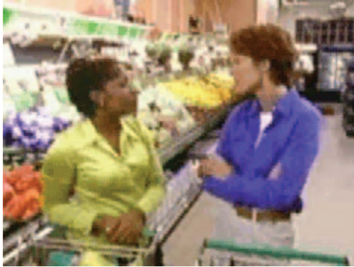
Figure 2 Still Image From Asthma Ad